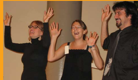
Dancing the "Reformation Polka"