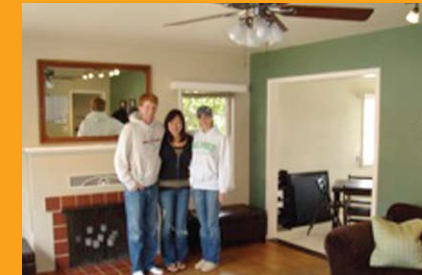
Peer Ministers in the remodeled LCM House