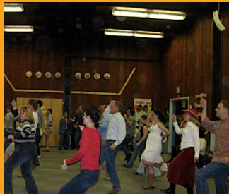
Chili Supper & Line Dance