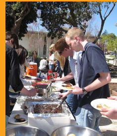
Free Sunday BBQ